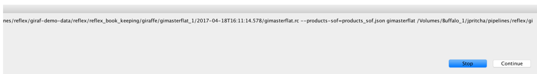
Figure 8.2: If the MasterFlat recipe fails, a ridiculously wide error message window like the one above will popup, once mouse-click-dragged to the left you will discover the Stop and Continue buttons. Click the Continue button and the Interactive MasterFlat GUI window will open, see figure 8.3.