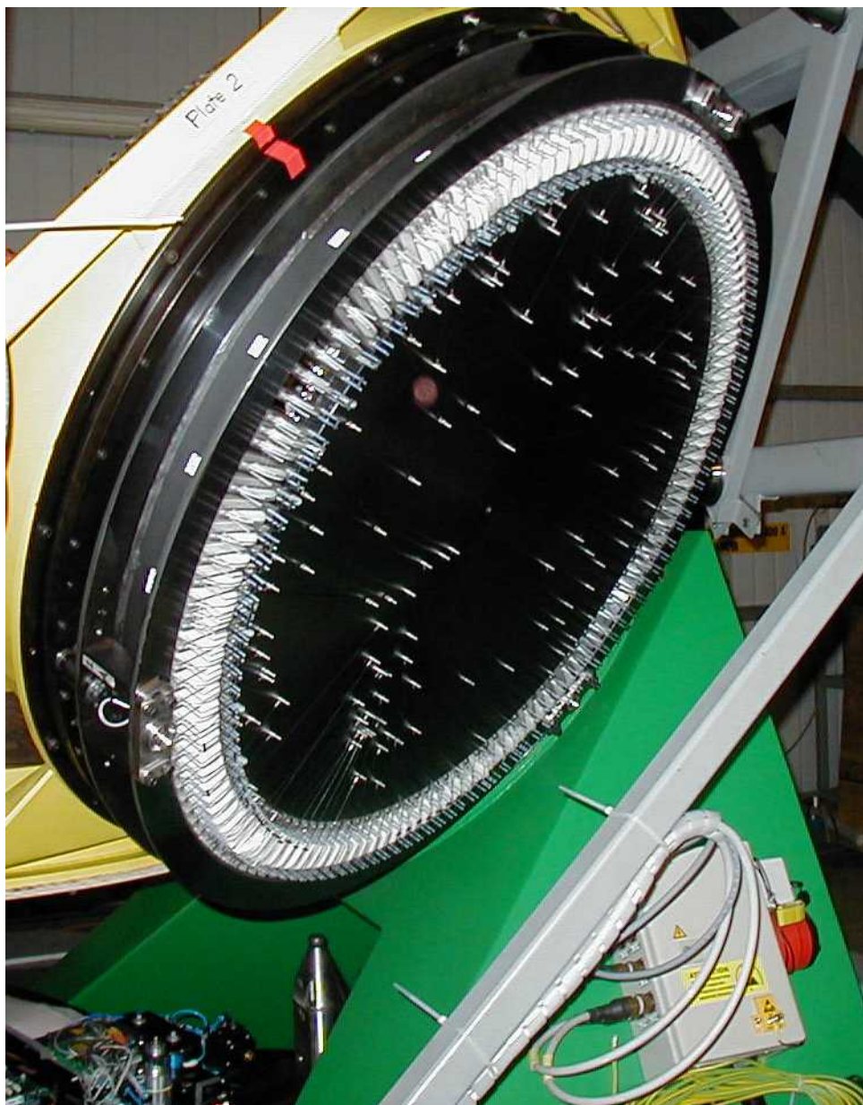
Figure 3.2: One of the two plates of the fibre positioner OzPoz. The fibres are attached to the plate using magnetic buttons.