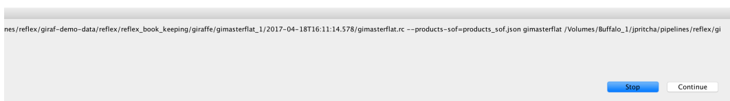
Figure 8.2: If the MasterFlat recipe fails, a ridiculously wide error message window like the one above will popup, once mouse-click-dragged to the left you will discover the Stop and Continue buttons. Click the Continue button and the Interactive MasterFlat GUI window will open, see figure 8.3.