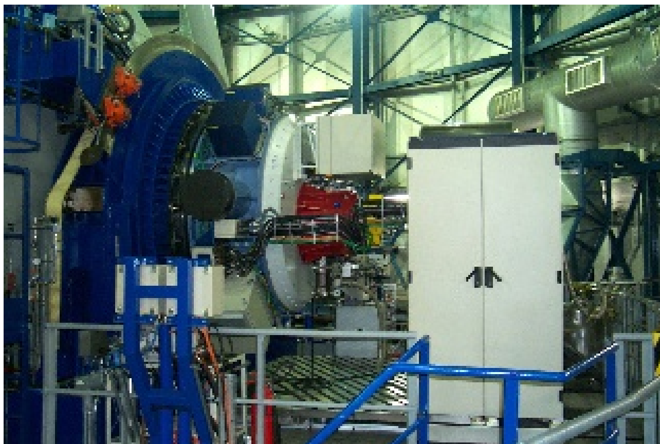
Figure 3.0.1: NACO at UT4.

Figure 3.0.1 shows a picture of the instrument mounted on the fourth unit telescope (Yepun) on the VLT.